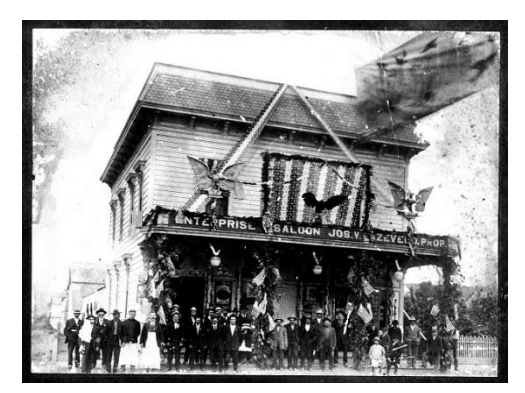
The Enterprise was definitely popular!

The Enterprise gained a reputation as being even more colorful than the very colorful Index up the street.