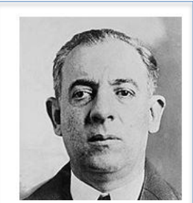
Ciro Terranova "Artichoke King"

Terranova had already gained an unsavory reputation, as newspapers described him as a "food rackets emperor," specializing in difficult-toacquire vegetables. He virtually engineered artichoke racketeering, becoming the