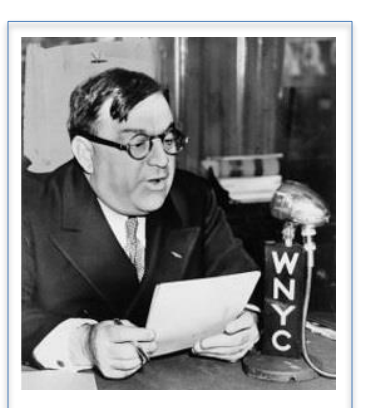
Mayor Fiorello LaGuardia

made artichokes more popular than ever, as they became front-page news, while newspapers and magazines were packed with recipes encouraging people across the nation to try the vegetable. Ironically, nearly everyone prospered except for the criminals, proving that crime truly doesn't pay—at least for long.